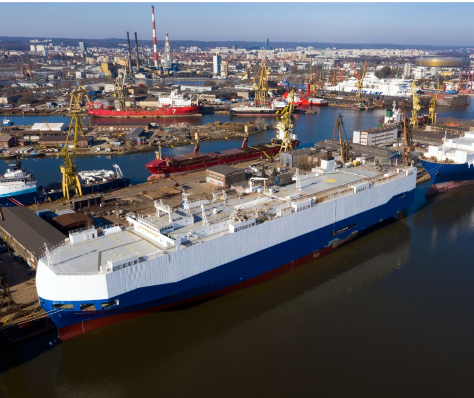
The Endurance (in the forefront) and Freedom car carriers moored stern to bow in Remontowa

Ballast Water Treatment Systems and more